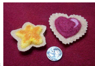
Felted "star" and "heart" wearable pins

have a wonderful, handmade pin that will surely receive loads of compliments from your friends. Time allotted for class will allow you to completely finish either one of the felted pins pictured. Class fee $10 plus supplies.