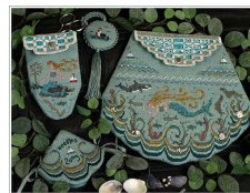
The Victoria Sampler "Mermaid Song Scissors Case and Needleshell

Keeper, O Morning Star, Summer Farm House