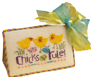
Triangular-shaped finishing technique

Small design finishing March 27, Saturday from 11a-1p Join Carol for a fun class where you don't have to stitch but you get to finish! You will learn two new techniques, assembly of an easel-type stand up and a 3-sided triangular shape. To see examples of these finishes, stop by the shop. You will need to bring a stitched piece of needlework to class, pressed and ready to assemble, coordinating fabric for the backing, floss, perle cotton or ribbon for embellishments. If you're not sure what type of ribbon or cording to select, we can