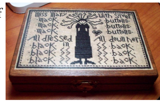
Miss Mary Mack hand-finished stitchee's box by La-D-Da

was stopping off in Kentucky on the way home to visit with relatives. As it was, we arrived on Friday afternoon, went to downtown Franklin for some shopping, ate dinner and then arrived back at the hotel to meet with shop-owner friends for a few hours before heading over to the Meet and Greet. This is where the shop-owners get to browse the offerings of the vendors. It's an abbreviated version of Market with no buying; just browsing. If you bring your Market Guide, you can make notes for yourself to visit certain suites