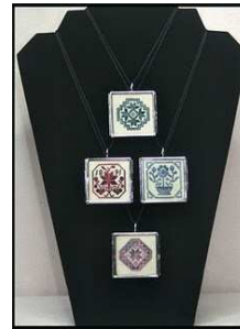
Milady's Quaker Pendants I

tional pendants separately. The pendant is hinged so you simply open it and insert your finished needlework. I think it would look great with a "sandwich" of two designs so each one can be seen on its own side of the pendant. If you