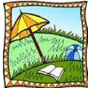
Grab a book, grab your stitching and find a grassy area to hang out in for a pleasant, summer afternoon!

One other stitching small that has been occupying my time is Spring Blossoms Fob by The Sweet-heart Tree. This is stitched on two different