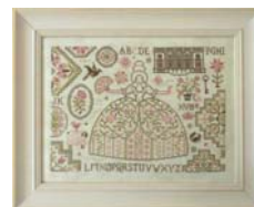
Jardin Prive's "Marquise"