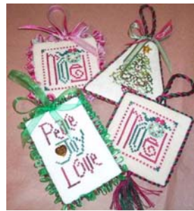
Get started now so your ornaments will be ready to hang in December!