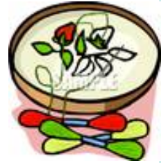
What do you want to learn?

What classes are you interested in attending? Please let us know so we can tailor our class schedule to your needs and skill level. We have many talented stitchers available that specialize in different needlework techniques. We hope you'll expand your needlework knowledge by attending one of our classes. Whether beginner, intermediate or advanced, we can offer classes to fit your particular area of interest!