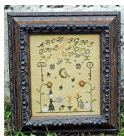
Halloween Garden by The Primitive Needle

Pictured here is the latest offering from The Primitive Needle. This cute little sampler is only available to shop owners attending the St. Charles Needlework Market later this month. Fortunately, I will be attending and plan on bringing home some of these little pretties.