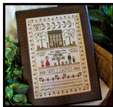
Little House Needleworks "The Family Sampler"

Victoria Sampler Santa's Village, Fabulous Tassels (Beautiful Finishing 5), Tiny Pack for Tudor Tassel from