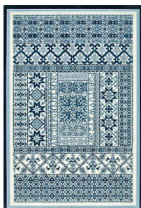
"Spanish Bleu" by Sampler Cove

Many of you have drooled over the various European designs that are here in the shop. Several of you have added "Spanish Bleu" by Sampler Cove to your sampler collection. Recently