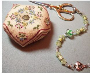
You might remember the Garden Tuffet piece I showed in a previous newsletter. Here is the assembled biscornu!

Why not try something new? There are several interesting techniques, such as appliqué, felting, embroidery, crewel, redwork, canvaswork, hardanger.....vow to try a new type of needlework this season. You might just find a new passion that will keep you stitching right through the season to winter!