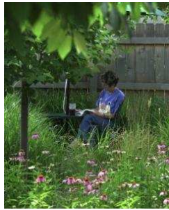
Need a get-away from the day to day?

This has been quite the labor of love. So many of you have asked if I plan on holding a retreat. Here's the answer. Yes. I have been having quite the time trying to locate a suitable retreat space. Either the space is too small, too far, too expensive or for non-profit's only. I've checked with hotels, bed & breakfast facilities, retreat centers, you name it. I never realized how many retreat places are out there!