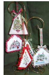
Learn how to finish shaped ornaments

ing ribbons, cording and other fun trims. If you don't have a design stitched that you can practice with, bring a blank piece of fabric or linen and just come to learn the process. Supplies you will need to bring: stitched design, coordinating cotton backing fabric or linen, thread or other fibers to use