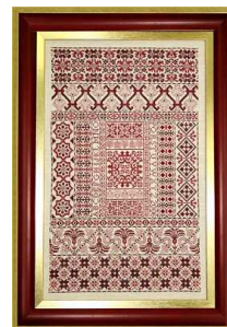
"Spanish Rouge" by Sampler Cove

shipped to the shop is "Spanish Rouge". These two designs would make quite a striking wall display. They are similar in design, yet slightly different. These companion pieces each have a design area of 10" x 15-3/4" when stitched on 36 count linen. Threads used are Au Ver A Soie, Needle-