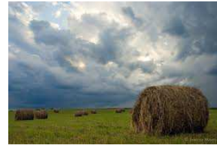
Enjoy the last few days of summer before the cool, autumn days set in.

There are lots of new fall designs that have shown up in the shop. If