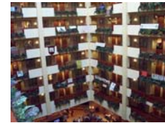
Embassy Suites -typical view of the vendor suites.

and what you do at Market, please see my blog at in-