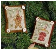
Button Up for Christmas #2