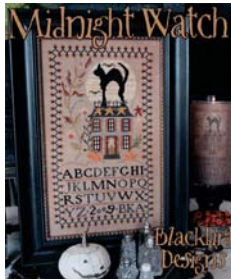
“Midnight Watch” by Blackbird Designs

St. Charles Market had a nice, non-rushed feel to it this year and I felt I had more browsing time. Of course, it could just be that I finally learned the ropes and didn’t have to ask so many questions! Either