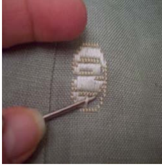
Put the needle down through the fabric between the two strands of

Last month we discussed a way you could enhance the appearance of your stitched work by using a technique called “railroading”. This month, I’ll share my favorite way of taming that floss; by using a Trolley needle when I stitch. A Trolley needle is typically worn on a finger of your hand. I was taught to wear it on the thumb of the hand that does not hold the needle.