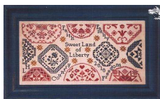
Cherished Stitches "Sweet Land of Liberty

Little House Needle- works Merry Skater,