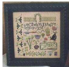
Shakespeare's Peddler "Magic Garden Sampler

Bent Creek Crow Berry Sam- pler, Patriotic Branch Eagle, A Pumpkin Full of Fun, Wave, Photobooth Flags & Friends