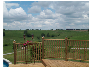
My vantage point from my seat on the deck. It was quite heavenly!

One of the highlights of the weekend was when my two sisters and I sat around the table stitching. I can't say that's ever happened before and I'm not sure when the next time will be that it will happen again! It brings back fond memories of Memorial Day parties at my Grandmother's house when she and her sisters would gather out in the