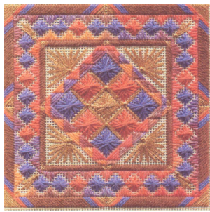
Tequila Sunrise counted canvas

Beginning Counted Needlepoint, Thursday, June 24 from 1p to 4p Expand your needlework skills to include counted canvas needlework with this colorful geometric design, Tequila Sunrise. You will learn diagonal satin, ray, straight and Rhodes stitch while working with wonderful Rainbow Gallery fibers. Don't be intimidated; this is easier to stitch than you think. Class fee $30 includes all