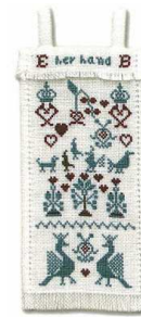
Penn-Dutch Towel by The Sampler House

Country Cottage Needleworks Liberty Lane, Little Bo Peep, Little