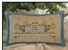
Liberty Lane by Country Cottage Needleworks

Bent Creek Uber Valentine, Photobooth Love Happens, ROWmance, Bliss