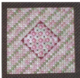
Rose Quartz by Needle Delights Originals