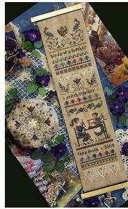
Birds of a Feather—a keepsake piece to remember those special stitching friends!