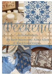
Weekend Quilts and Projects