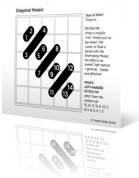
Sample stitch diagram page

advance your needlework knowledge as a stepping stone from regular cross-stitch.