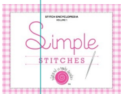
Stitch Book cover

Here are a couple new products that will be perfect for gift-giving or toss in your own stitching bag! Simple Stitches is a purse-sized stitch book filled with large, easy-to-read, black and white diagrams, needle guide and thread guide. It includes left-handed tips and stitches. Get this book to learn new, simple stitches to