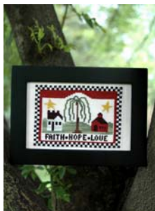
Faith Hope Love new cross-stitch design by Myrtle Grace Motifs