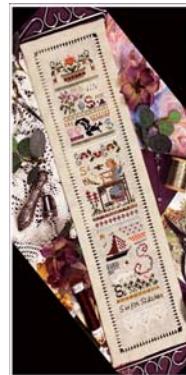
Victoria Sampler's Alphabet Series "S is for Stitcher"