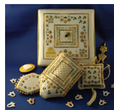
Bee's Garden Stitching Accessories by Wendy KC Designs

Broom, Tin Kits Just Another Button Co: Pin sets!, Boys Are Back in Town Papillon Creations: The King's Pleasure, Heatwave, Mary Queen of Scots Wendy KC Designs: Bee's Garden Stitching