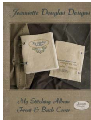
My Stitching Album Front and Back Covers

ing treasures in each pocket; a needle minder, thread winder, mother-of-pearl ruler or other needle-work memorabilia. There are two more chapters to be released, Rhodes Rhapsody in September and Herringbone Hour in November. If you are currently working on this stitching journal but would