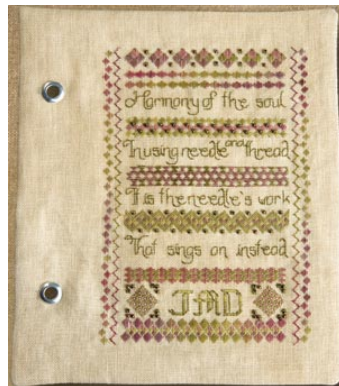
My Stitching Album Chapter 6—Hungarian Harmony

Jeannette Douglas Designs “My Stitching Album” is an 8-Chapter work of art that features a new stitch for every journal page. The latest Chapter showcases the Hungarian stitch and is shown worked in warm purples and greens. Each stitched page, when assembled, houses a pocket on the reverse side. You can tuck stitch-