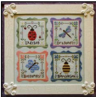
Choose one of the garden insects above

Refresh your skills of stitching on linen with over-dyed threads. The class piece is your choice of Country Cottage Needleworks "Bumblebee", "Butterfly", "Dragonfly" or "Ladybug" Garden Party series designs. Carol will explain how to get started stitching on the fabric, the proper way to start and stop a thread, various ways to stitch with over-dyed threads to achieve different variations of color and loads of other tips and tricks.