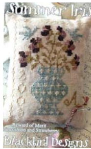
Summer Iris by Blackbird Designs

Following on the heels of the monthly stocking success will be a set of 13 vintage Halloween stockings. This chart is due out mid-August. You may have already received an email from us telling about the pre-order. These stockings are sure to be a hit; the response to the new design has been overwhelming! The fabric used for the models is R&R Café Kona, 18th Century Brown and a