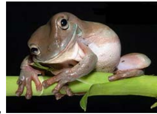
What kind of shoes do frogs wear? Open toad!

Spring. It's filled with new possibilities. It's almost like New Year's resolu-