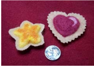
Felted "star" and "heart" wearable pins

You will learn how to needle felt a small, wearable pin using a single felting needle, a stencil, wool roving and some wool backing. Sew a pin backing to the wool and you have a wonderful, handmade pin that will surely receive loads of compliments from your friends. Time allotted for class will allow you to completely finish either one of the