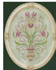
Glendon Place "Dance of the Tulips"

Stony Creek Stand-Ups Sweet Dreams, Don't